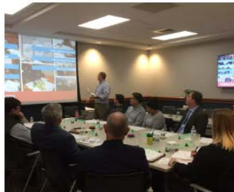
About the Project

Holly Springs is a great place to be. It's a family place and a friendly place. We have been named the safest town in North Carolina among towns with at least 25,000 population. People want to live here. Help Holly Springs continue to be the town you want it to be. Participate in re:Vision Holly Springs as we begin updating the policy guide that shapes decisions on future land use and more.