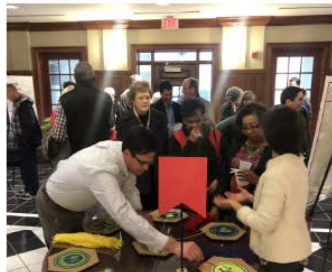
Community Ideas Exchange