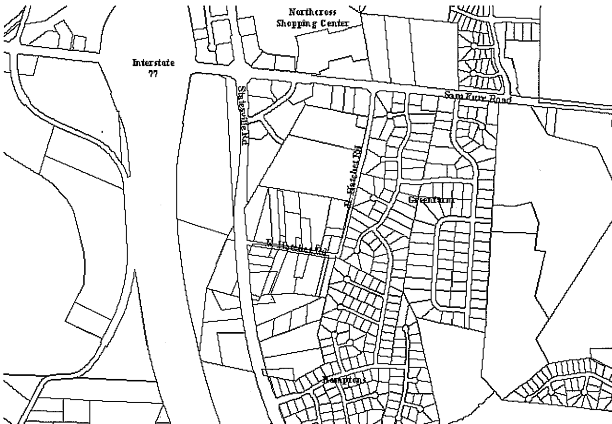
Property Lines in and around the Rich Hatchett Community

Despite the rapid development over the past decade, there are still a number of undeveloped tracts along Rich Hatchett Road and adjoining Statesville Road. Various development proposals have been considered for such tracts, in all instances by property owners not residing within the Rich Hatchett community. For example, in 1997 a petition for rezoning was made to the Town in anticipation of an outdoor amusement facility. The property in question lay directly adjacent to a number of homes on the west side of Statesville Road. The neighborhood mobilized to defeat this proposal, citing noise, traffic, and lighting concerns and its general incompatibility with the residential nature of the community. The case exemplified the strong development pressures that continue to exist in this area and heightened the concern of town planners and neighborhood residents about appropriate planning for undeveloped tracts.